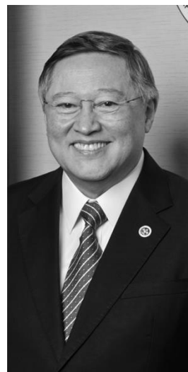
Sec. Carlos G. Dominguez III (DOF)