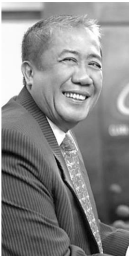
Sec. Arthur P. Tugade (DOTr)

Designation: Chairman Date Appointed: October 2016 to Present