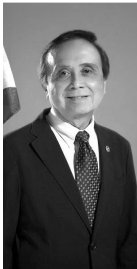
Sec. Ernesto M. Pernia (NEDA)