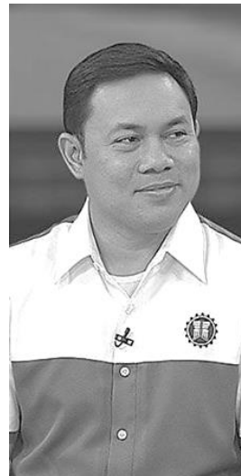
Sec. Mark A. Villar (DPWH)

Professional Qualifications and Other Affiliations : General Manager, Metro Rail Transit (MRT) 3, Department of Transportation and Communications (DOTC); Undersecretary for Communications, DOTC; Assistant Secretary for Special Concerns, DOTC; Chief, Land Transportation Office (LTO); Director, Civil Security Group (CSG); Regional Director, Central Luzon Regional Police Office; Director, Philippines National Police (PNP) Intelligence Group; Chief, Anti-Drugs Task Force, CARAGA Region; Chief, Task Force Lawin, Presidential Anti-Crime Commission; Chief, Task Force Gemini, PNP; Provincial Commander, Pampanga Philippine Constabulary/Integrated National Police; Commander, Olongapo METRODISCOM; Battalion Commander, Reaction Strike Force BN; Deputy Chief and Executive Officer Commander, METROCOM Intelligence and Security Group; Chief, Narcotics Detection Branch CANU